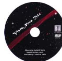
Performance DVD with DVD Authoring

Improve the chances of being accepted into major competitions, the top music schools and festivals. Students submitting BPC Recordings have been accepted to the following